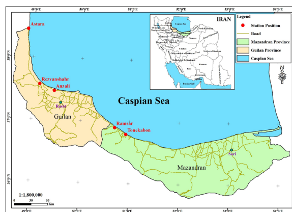
Figure 1. Location of the studied stations

Thirty fish samples were collected from five fishery sta-