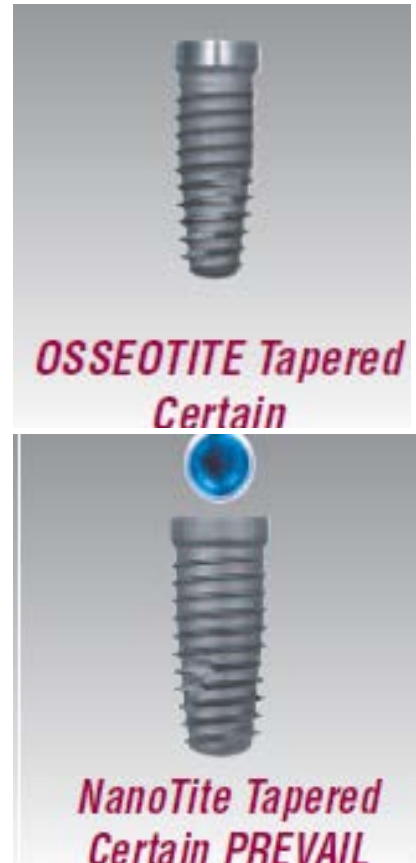
Figure 1- Biomet 3i dental implants

sertion of the implant, clinical and radiographic examination of the patients was performed by a single clinician. After confirming the ideal prosthetic and anatomical condition of the surgical site, the implants were replaced in the edentulous area.