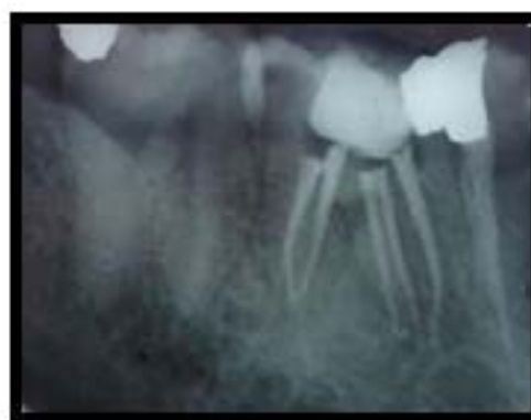
Figure 2. Right mandibular first molar with five canals.