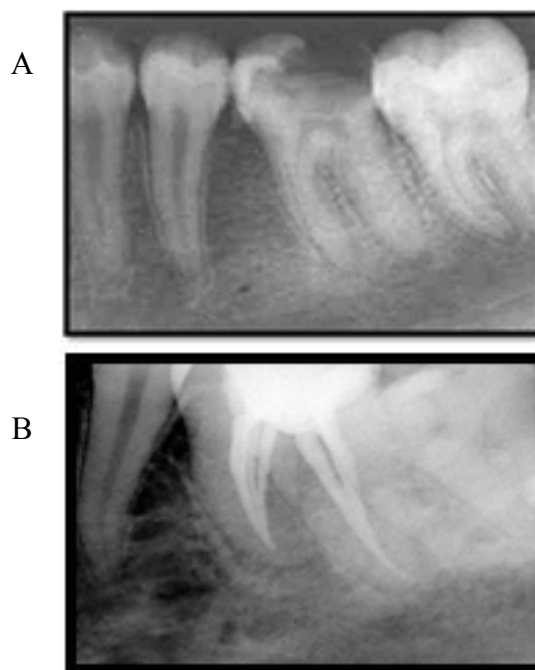
(A: Primary radiography, B: Initial working length, C: Final radiography)

mesiobuccal canal was dried with paper points, a bloodstain appeared on the apical third of the paper points which made us suspect another canal. The area between the openings of both mesial canals in the pulp chamber floor was explored and a third canal located. Preparation of canals was performed exactly as in Case 1. A Radiograph with distal angle was performed after obturation (Figure 2). It showed a mesiolingual canal, independent in its path toward the apex, a mesiobuccal canal, and a third intermediate canal (MM canal) converging with the mesiobuccal in the apical third and terminating at the apical foramen. The distal root had two canals (Figure 2).