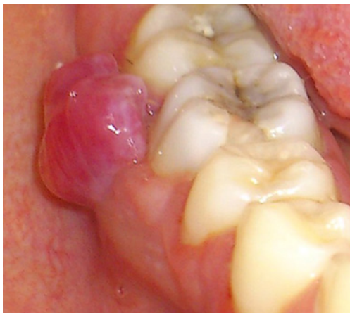
Figure 1. Clinical feature of the gingival lesion

The lesion disappeared completely after one month without any periodontal or surgical intervention (Figure 3), and was filled with amalgam restoration.