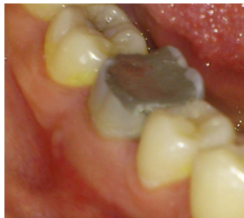
Figure 3. After parturition, the lesion completely disappeared